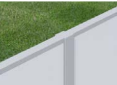
Flush post and wall capping