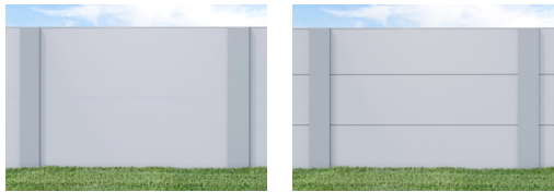
Standard Joint Express Joint