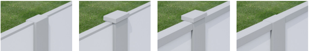
Flush post and panel capping External post and flush panel capping External post and panel capping Flush post and external panel capping