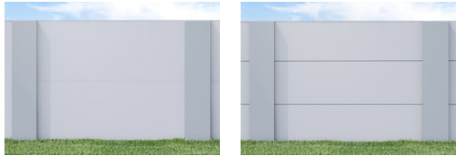
Standard Joint Express Joint