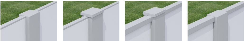
Flush post and panel capping External post and flush panel capping External post and panel capping Flush post and external panel capping